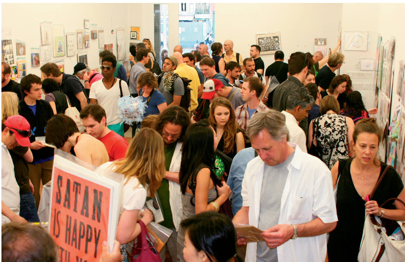
View of the event "Power to the People," May 1, 2010.

ON A WARM SATURDAY afternoon last spring, nearly 400 people lined up outside the contemporary art gallery Feature Inc. on New York's Lower East Side for an event that promised "free art: one piece per person please." Billed as "Power to the People," the event was a "benefit" at which works donated by 263 artists—a number of them well-known, with lengthy résumés and pieces selling for tens of thousands of dollars—were given away to the public in a spirit of love and sharing. No money changed hands.