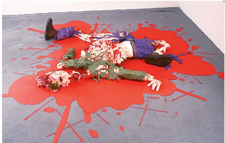
Above, Tom Friedman: Untitled, 2000, construction paper, 12 by 114 by 120 inches.

limited in Chicago, and, in one sense, the timing of its move was serendipitous: that fall, Feature’s former Chicago home, an early Louis Sullivan building on West Huron containing a dozen or more galleries, burned to the ground.